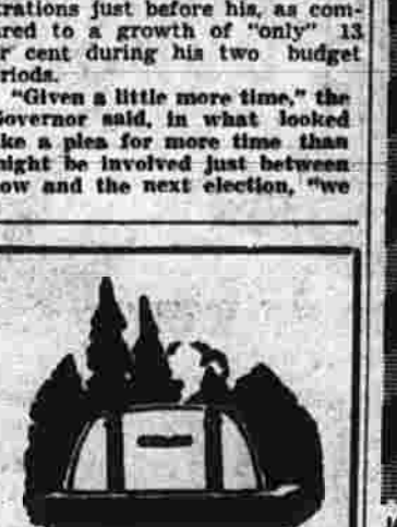
JAMES E. PEPPER... This whisky makes your party a success!

This business of compounding prescriptions is a child's play. It requires knowledge, skill, and a high degree of accuracy.